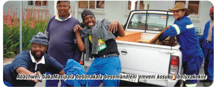
Abachweli bakaMasipala bebonakala besemändleni emveni kosuku obeluxakile